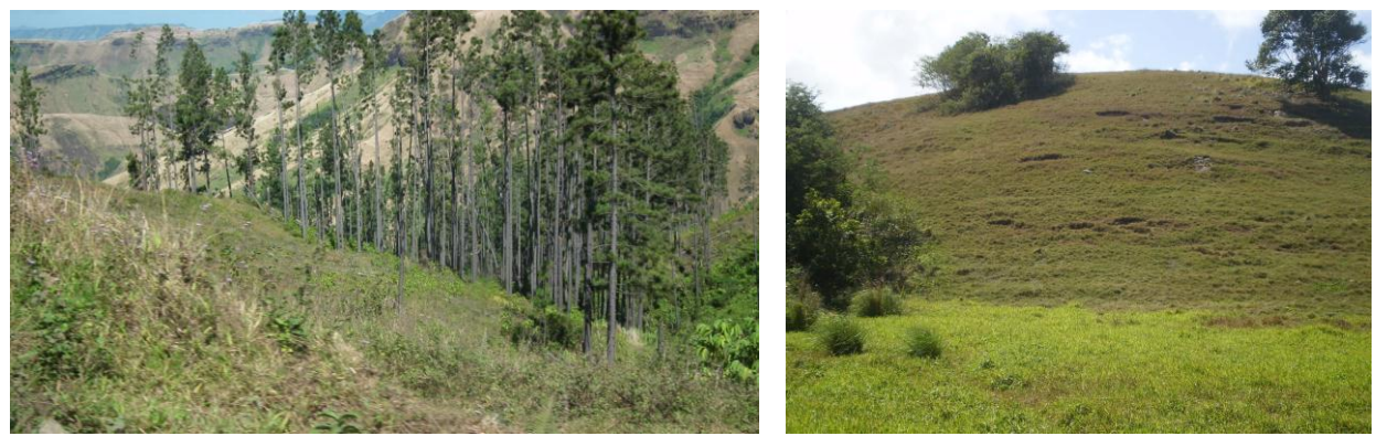
Pine plantations on LUC class VIs land (degraded talasiga land)