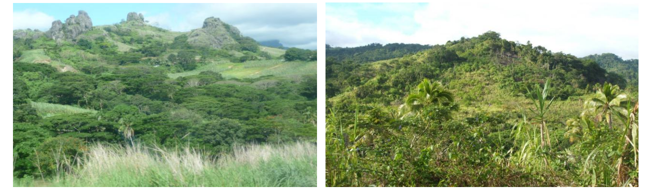
LUC class VIIs with boulder and shallow

Major class VII has no subclass on either wetness or climatic limitations.