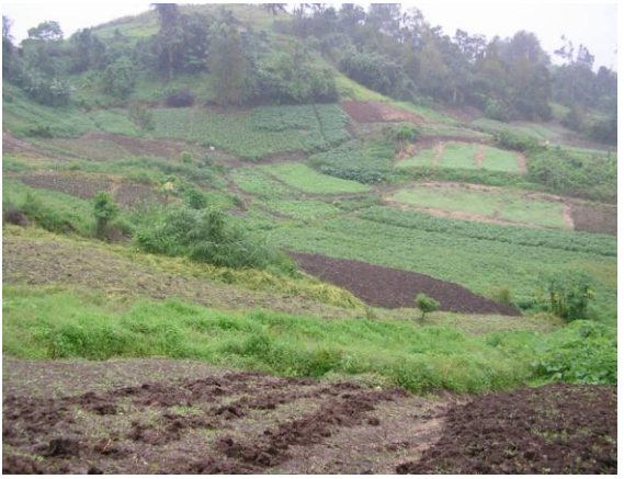
Cultivated class IV land (IVe) in, Sakoca, Savutalele