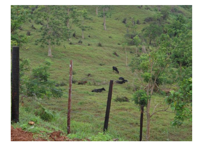
Grazing on class Ve land