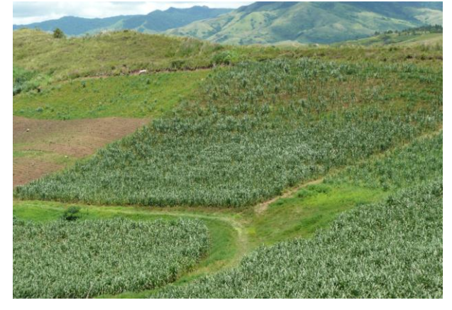
Sugar cane on LUC class IV land (IVe )in Nadi