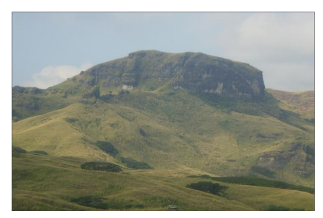
Bouldery, shallow class VIIIs lands Extremely steep with class VIIIe land Unsuitable for production used in Agriculture and Forestry